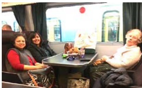
Friday, 31 July 2020: On the train to Palmy!

THEME: Exploring the Realities of Our Existence, Harmonizing Spirit and Matter and Liberating the Soul