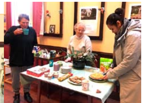
21 June 2020 - Afternoon Tea and informal Members' Forum: to discuss how we can move forward in the coming months.