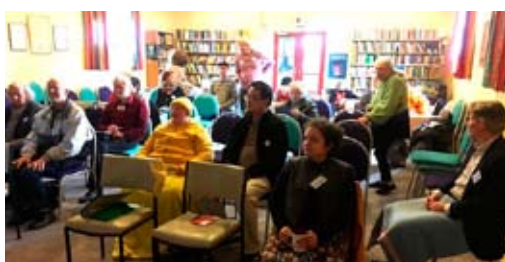
Saturday, 1 August 2020 - Attendees getting ready for the next session.

The recently concluded Regional Event was hosted by Palmerston North Branch was a successful and inspiring weekend. Around 30 persons attended the 2-day event including members from the Central Region branches viz., New Plymouth (2), Hawke's Bay (5), Wellington (7+1), and also Far North Branch (1). Two of our members were billeted in a member's home, and we thank her.