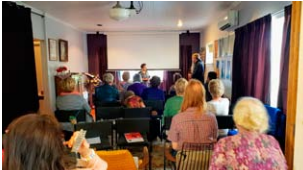
Hamilton Lodge has newly renovated and extended their main hall and installed new shelves in the library.