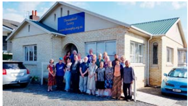
Hamilton Lodge is one of the TS Lodges with their own building, a fantastic library and car park.